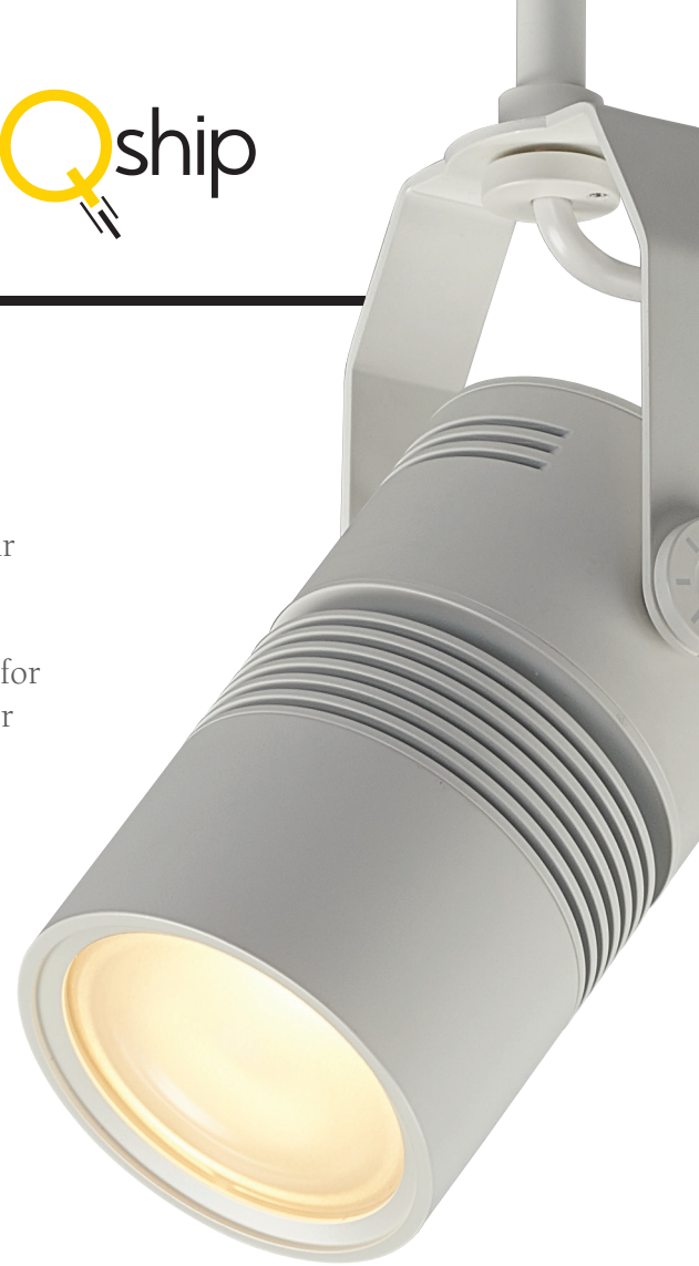
Chroma Z15 Track Spot white finish

light source shade finish color temperature reflector adaptor option example: 350 420 wh 3 m geowh